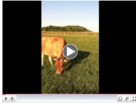
Jersey cow eating dinner